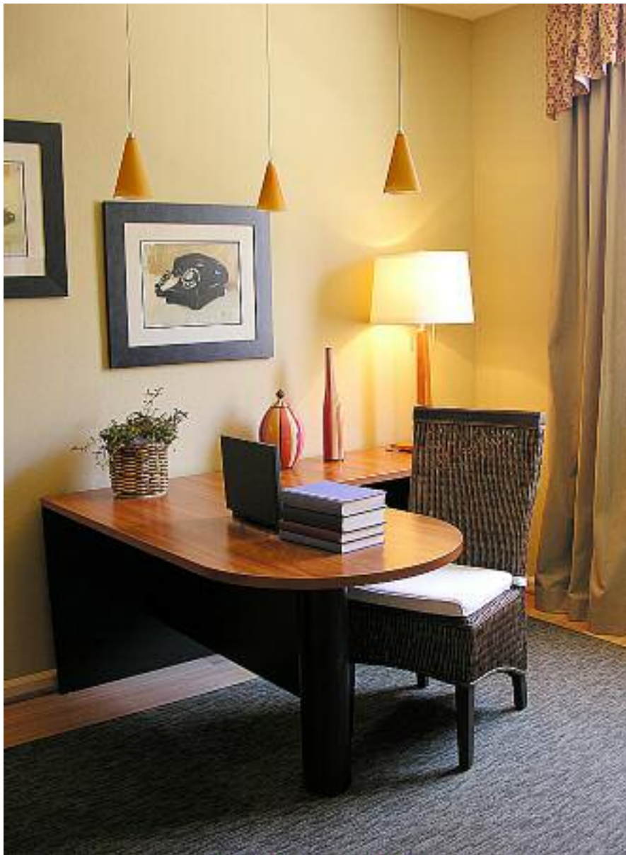
The desk in this home office shows the proper "commanding position."